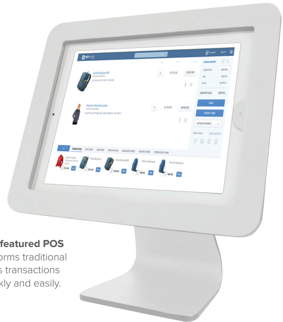
Full-featured POS performs traditional sales transactions quickly and easily.